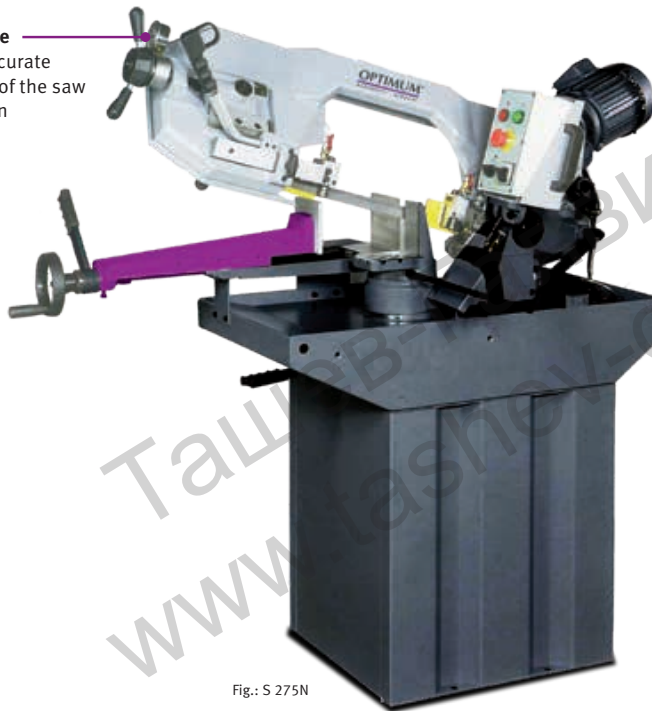
Fig.: S 275N